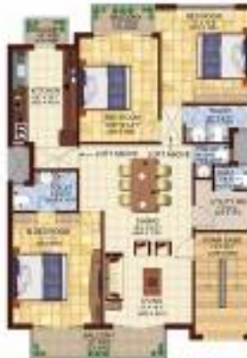
1st & 2nd floor

Tentative sale area: 1550 sq. ft. 3 BHK + Utility