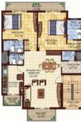
1st & 2nd floor

Tentative sale area: 1475 sq. ft. 2 BHK + Utility