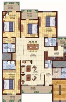
1st & 2nd floor